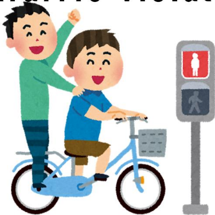
Ignoring red light while double riding