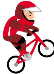
Poorly maintained bike on the road (e.g. without brakes)