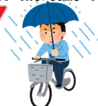
Stop sign violation while using umbrella