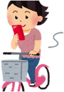
Using mobile phone